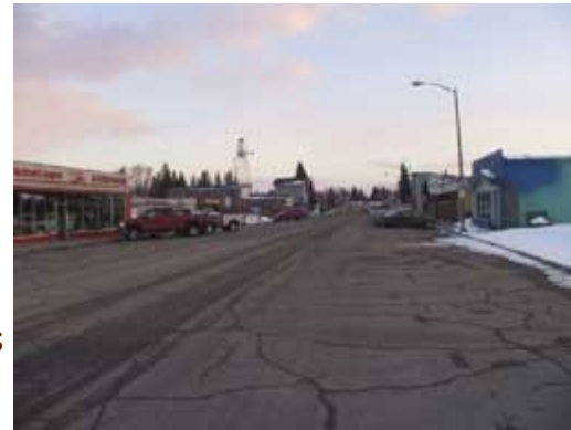
Main Street Cook, MN