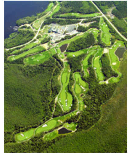
Fortune Bay - The Wilderness

For other area Courses visit: TeeMaster.com or GolfCourse.com